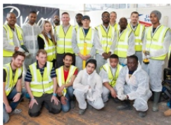
The Rydon construction workers will be trained by Canning Town charity Anchor House