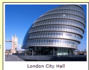
London City Hall