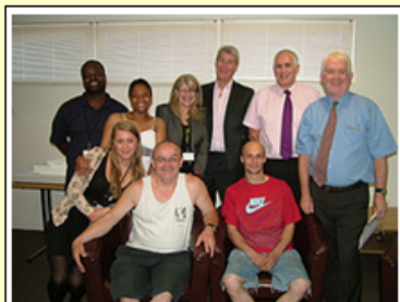
Patron Jeremy Paxman on recent visit

A small homeless charity in East London has been found to have saved society and tax payers more than £5 million a year by helping to turn around the lives of its homeless residents. A report undertaken by experts at Oxford Economics found that Anchor House, residential and life-skills centre in Canning Town, Newham, provides £3.98 in benefits to society for every £1 invested in its operations.